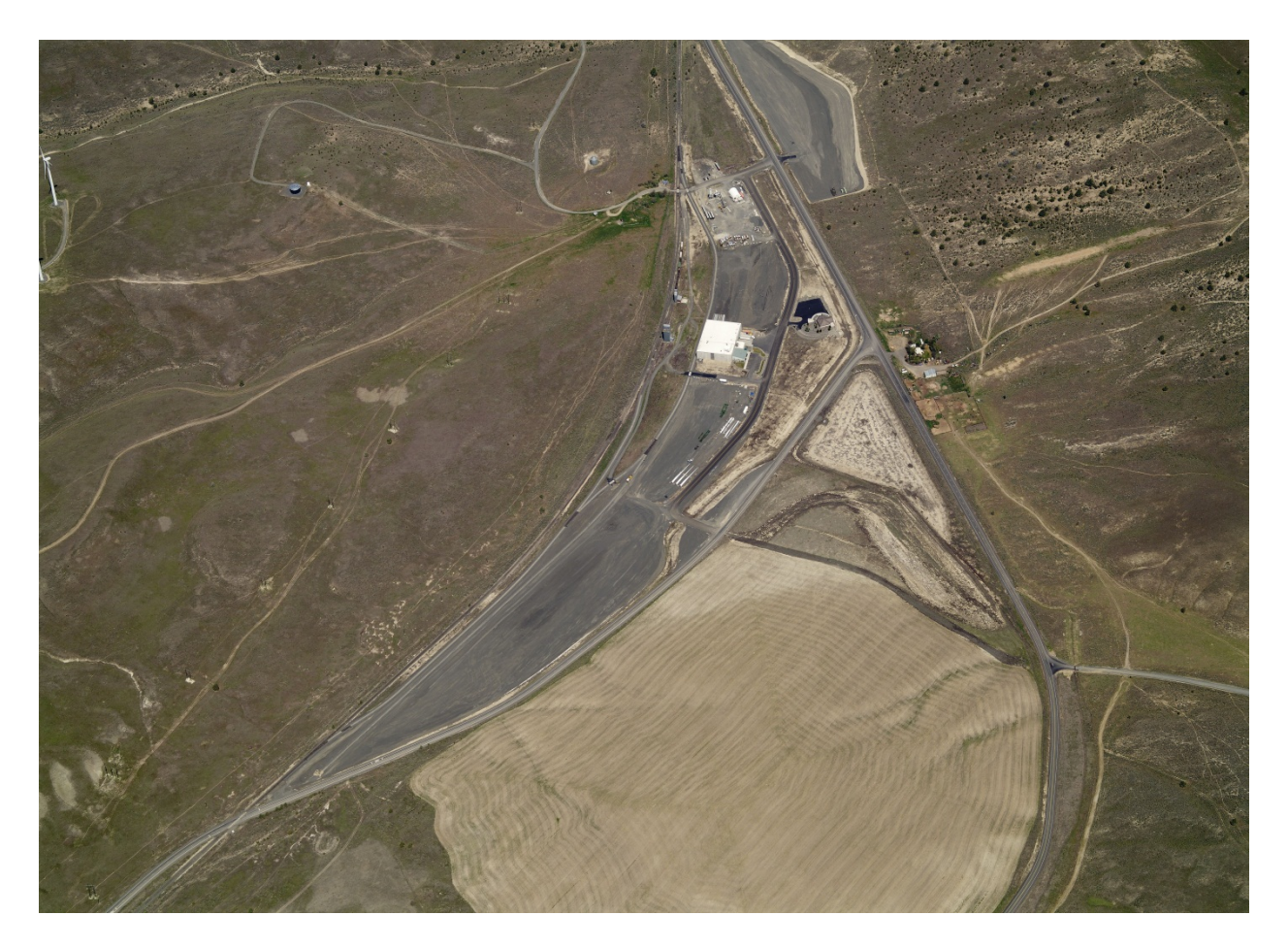
Industrial Development Sites, up to <del>90</del>- 65 acres remaining 200 acres undeveloped private Industrial land also available Arlington, Oregon August 2018