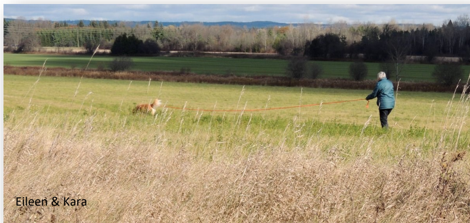
Eileen & Kara

Practical Applications: Tracking skills can be used in search and rescue operations, hunting, and even in some sports and competitions.