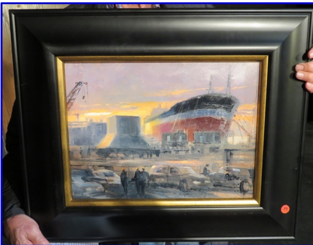
2 nd Place: Lee Radtke “Waiting for Parts” (oil)