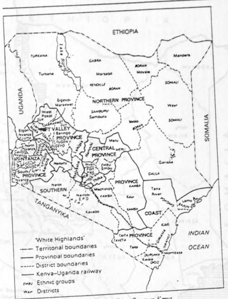
Map showing the Provinces. Districts and Ethnic Groups in Kenya.