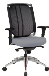
VO-H A : 20" C : 17" - 22" E : 24"