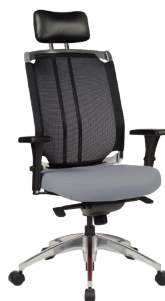
VO-E A : 20" C : 17" - 22" E : 32"