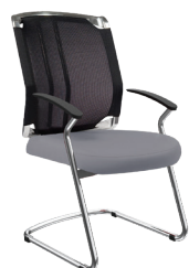
VO-L-6 A : 20" C : 18" E : 22"