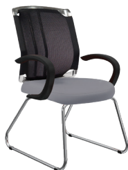
VO-L-3 A : 20" C : 18" E : 22"