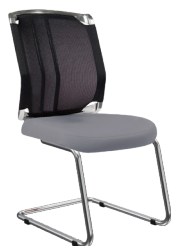
VO-L-2 A : 20" C : 18" E : 22"