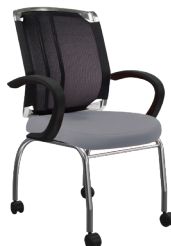
VO-L-4 A : 20" C : 18" E : 22"