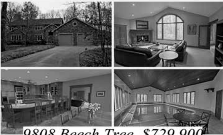
9808 Beech Tree $729,900

6,123 Square Feet Main Living • Indoor Pool ¾ Wooded Acres • Frankenmuth Schools 4 Bedrooms + Office • 3 Full Baths • Heated Floors