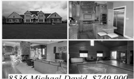
8536 Michael David $749,900

6,123 Square Feet Main Living • Indoor Pool ¾ Wooded Acres • Frankenmuth Schools 4 Bedrooms + Office • 3 Full Baths • Heated Floors