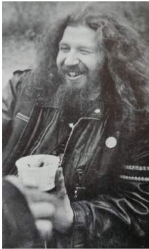
Red Robinson back in the day