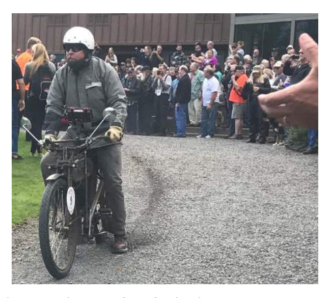
dragging his one foot for braking.

As the riders came onto the driveway, they were cheered by the crowd. Riders came in at first in ones or twos, but then arrived in a steady stream. Memorable was one rider, riding relatively quickly, negotiating a curve in the gravel drive, and then