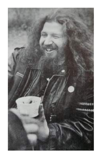
Red Robinson back in the day