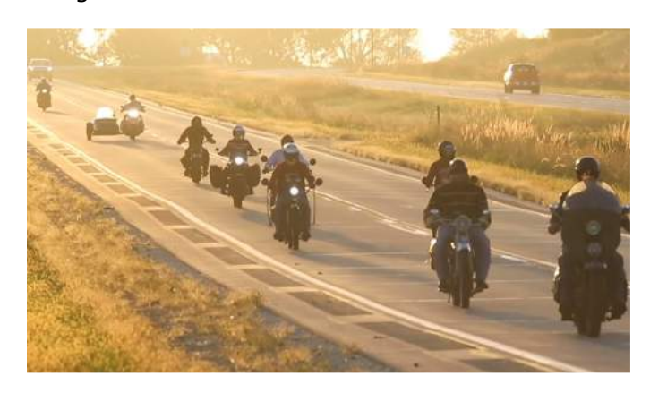
Cannonball 2018 in Dickinson, Iowa from U-tube, <a href="https://www.youtube.com/watch?v=l-o3ciZZZVQ">https://www.youtube.com/watch?v=l-o3ciZZZVQ</a>

As we chatted, I asked the one gentleman with an obvious southern accent where he was from: "Dallas" he said. Hmm - I couldn't resist and asked with a wry-smile: "Dallas, Oregon?" "No, Dallas Texas" he replied, politely refraining from adding "dumb-a**."