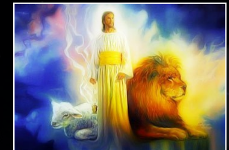
Yeshua ben Joseph and Yeshua ben David.

FOR ILLUSTRATION PURPOSES ONLY