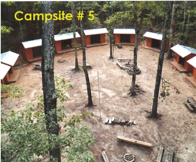
Campsite # 5

TROOP 599 SUMMER CAMP JUNE 23 – 30, 2018 CAMP BUCK TOMS