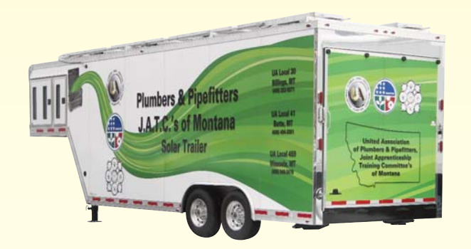
Two entry doors, back loading door, and one side mounted awning door, and solar mounted roof panels

Two entry doors, back loading door, and one side mounted awning door