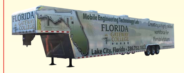
Two entry doors, back loading door, and two side mounted awning doors