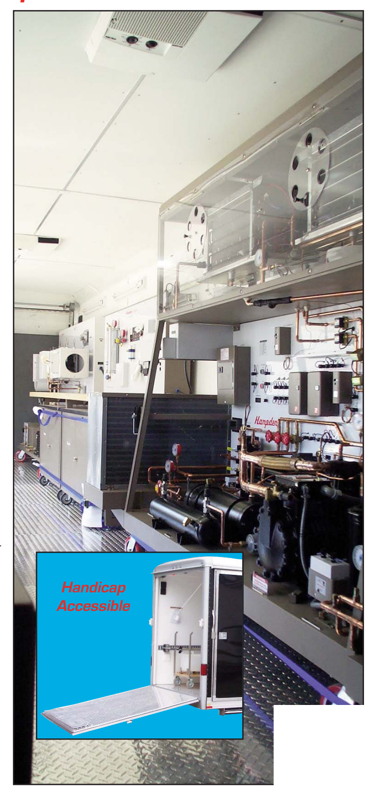
An inside look at one of Hampden's Mobile Classroom

NOTE: All Hampden training equipment can be provided with the Hampden bar-lock fastening system. This system provides a carefree means of transporting your equipment in the trailer.