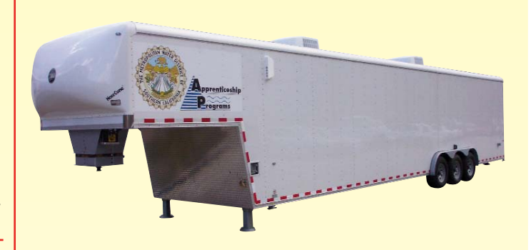
Two entry doors, back loading door, and two side mounted awning doors