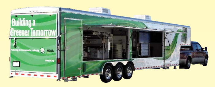
Two entry doors, back loading door, and two side mounted awning doors, and solar mounted roof panels