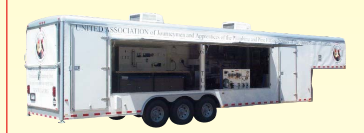
Two entry doors, back loading door, and two side mounted awning doors