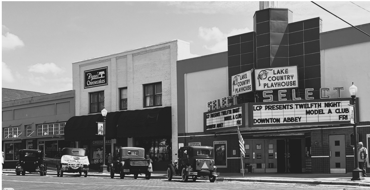
International Model A Day 2025, Autumn Trails, Mineola, TX