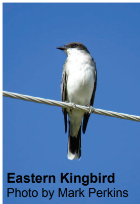
Eastern Kingbird

Sunday morning up early and stopped at White Rock Lookout with great vistas of the Rio Grande Valley and the Rio Grande Gorge. While there, we saw White-throated Swifts . We then went on to Bandelier National Monument. We had Hairy Woodpeckers , Rock Wren , Townsend's Warbler , Wilson's Warbler , Grasshopper Sparrow , Canyon Wren and a great look at a Brown Creeper , amongst others. We also enjoyed the Pueblo ruins. We had a picnic lunch at Bandelier. We then headed up to the Jemez Mountains and birded a meadow where we had Yellow-rumped Warblers and a pair of Red-tailed Hawks . Later that evening, we went out to Valles Caldera where we saw lots of beautiful Mountain Bluebirds , lots of Savannah Sparrows , Brewer's Blackbird , Northern Harrier and a Peregrine Falcon . We ended up the day Elk watching and we could hear the bulls bugling in the distance before they were actually seen.