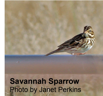
Savannah Sparrow

17 people made the trip and enjoyed the cooler weather of the mountains. Friday afternoon we birded the Los Alamos area where we were able to see some Band-tailed Pigeons , Acorn Woodpeckers , and lots of Pine Siskins at feeders at Deer Trap Canyon.