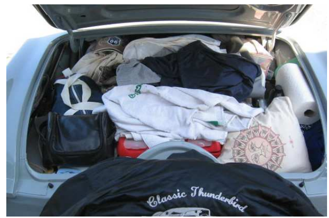
This is how you pack a TBird trunk