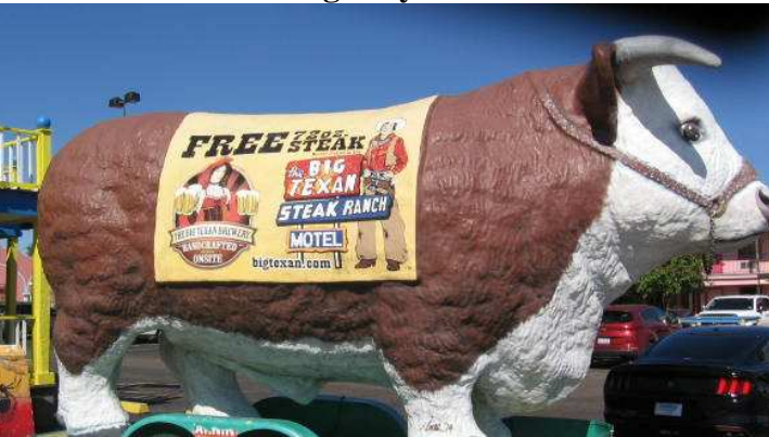
72 ounce steak place