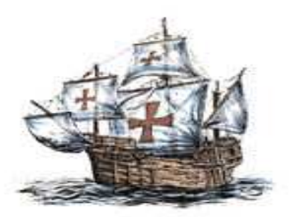
Columbus Day Oct. 10th Error! Objects cannot be created from editing field codes.