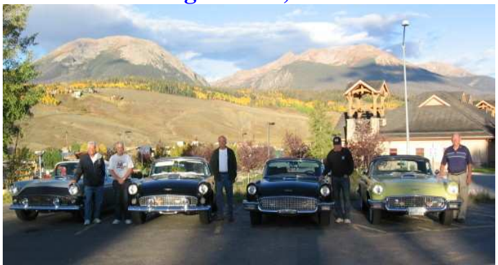
This is the picture we took just before the push rod went south