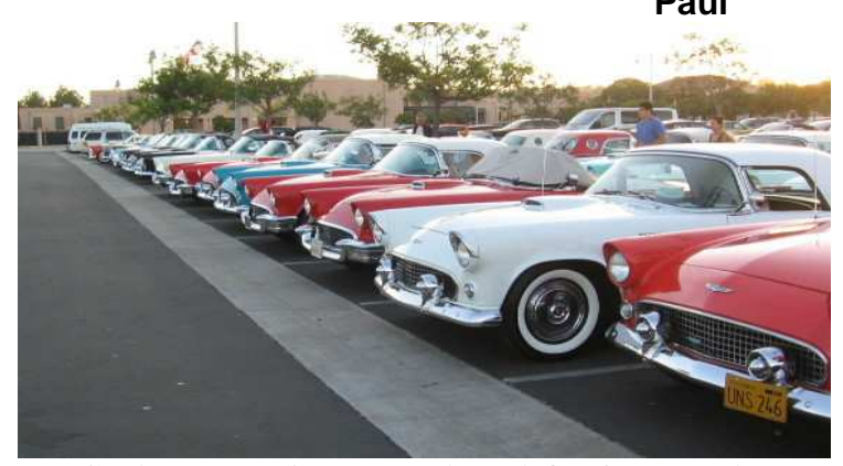
Cruise to the Corvette Diner (1/2 of the cars)

All in all, it was a great trip with great people .