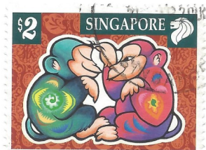
Below: there are many countries that issue stamps for the Chinese New Year

The 8th February was the first day of this brand new year of the ninth animal in the Chinese Zodiac. People born in the Year of the Monkey are considered to be witty and intelligent and tend to be fast learners and astute opportunists. Personality trends like mischievousness and curiosity mean that people often think of those born in the year of the monkey as naughty.