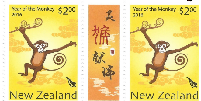
Above: the stamps are called a gutter pair, that is stamps with a design between them.

According to tales and legends, the beginning of the Chinese New Year started with the fight against a mythical beast called the "Year". The "Year" looks like an ox with a lion head and inhabits the sea. On the night of New Year's Eve the "Year" will come out to harm people. Later people found that the "Year" fears the colour red, fire and loud sounds. This is why celebrations now include hanging of red lanterns and firework displays.