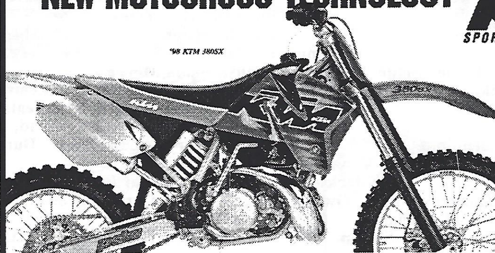
'98 KTM 380SX

FOR '98, ONE COMPANY UNLEASHES NEW MOTOCROSS TECHNOLOGY