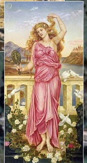
Helen of Troy by Evelyn De Morgan