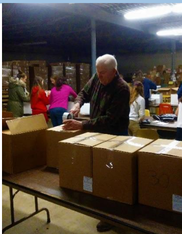
A weekly volunteer joined by a school group.

If you would like to read Paul's complete life story, you can access it at: paulallen.info