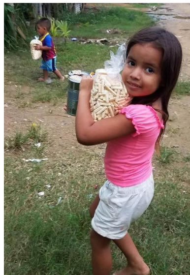
Children living at the city dump are so happy to receive gifts of cracker sticks, beans, and chocolate!