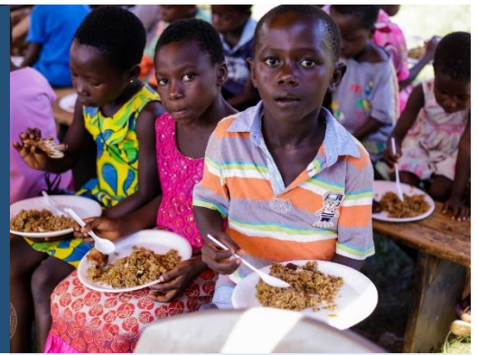
Children in Ghana enjoying delicious rice!

The Salvatorian Mission Warehouse was BUSY in 2019!