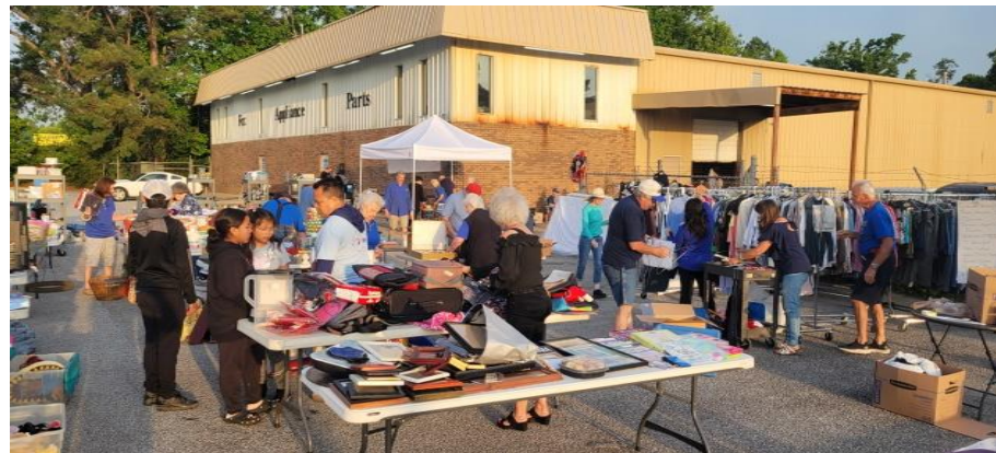
Last Year's Yard Sale