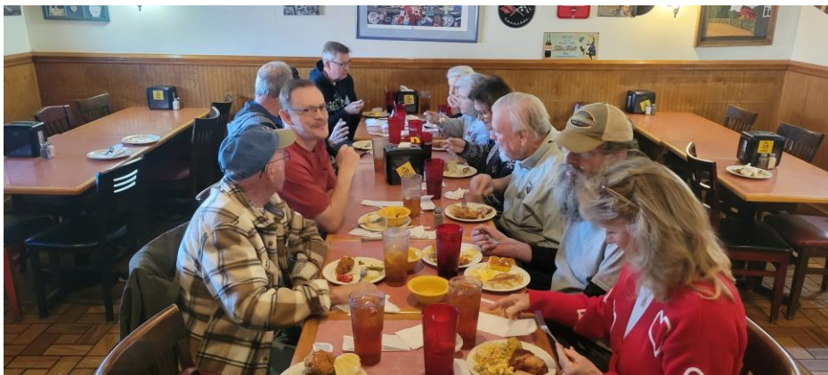
January Lunch Away