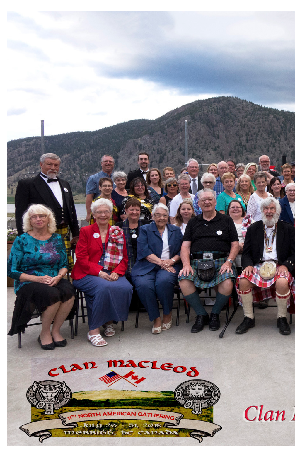
CMSC Newsletter # 65, Page 2