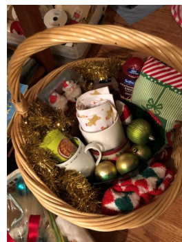
A sample basket that will be prettily wrapped.

Call or text Bette, 586-557-3287 or Diana, 313-690-1515 if you have any questions.