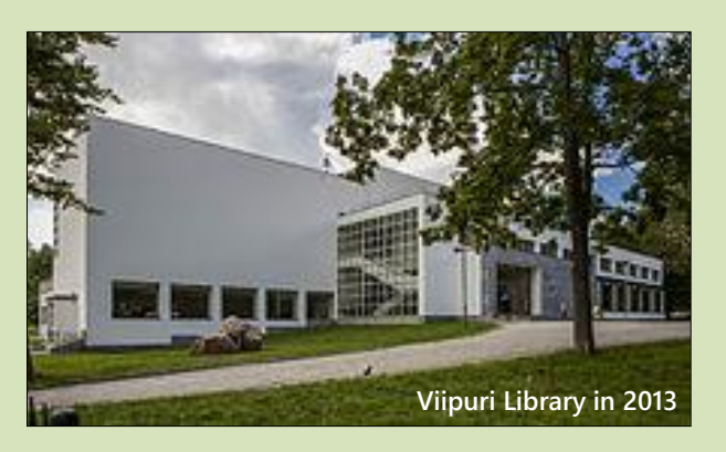
By Kaj Rekola, Adapted from Wikipedia

In 2014, the restoration committee and the library received the World Monuments Fund/Knoll Modernism Prize for the restoration work. In 2015 it also received the Europa Nostra Award, the jury calling the restoration "exceptionally well-researched and highly sensitive" and commending the project's transnational collaboration.