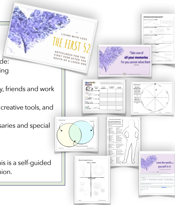
Unique Emails & Handouts