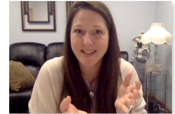
Watch a promo video