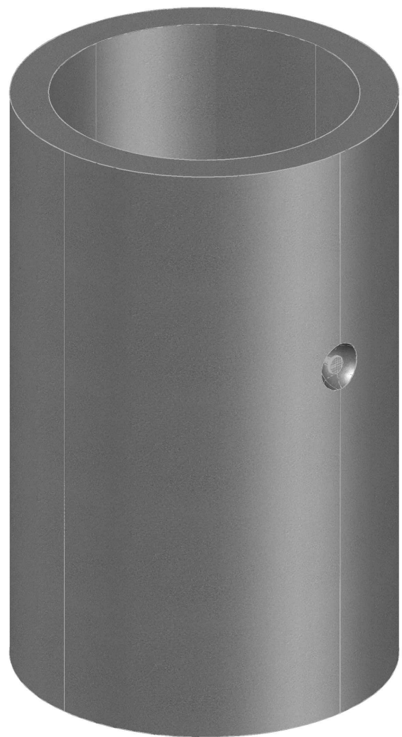
ISOMETRIC VIEW NTS