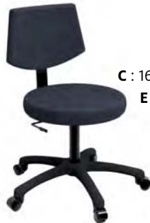
1507 A : 17" C : 16 1 / 2 " - 21" E : 10 1 / 2 "