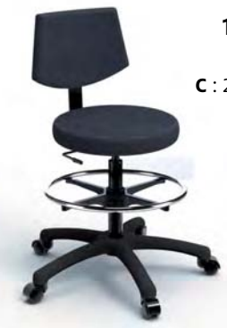
1507 DSN A : 17" C : 24 1 / 2 " - 34 1 / 2 " E : 10 1 / 2 "