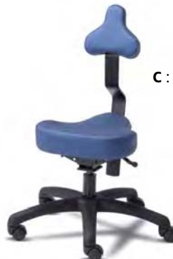
MED A : 15" C : 17" - 22" E : 8 1 / 2 "