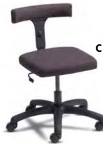
1502 A : 17" C : 16 1 / 2 " - 21" E : 3 1 / 2 "