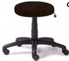
1500 A : 17" C : 16 1 / 2 " - 21"