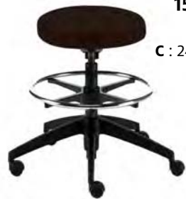
1500 DSN A : 17" C : 24 1 / 2 " - 34 1 / 2 "