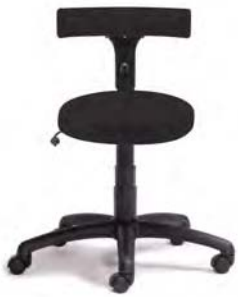
Q1500 A : 17" C : 16 1 / 2 " - 21" E : 3 1 / 2 "