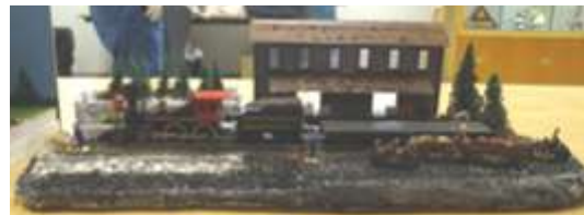
2nd Jerry Lawler