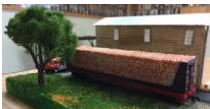
Youth 1st Skylar Adkins