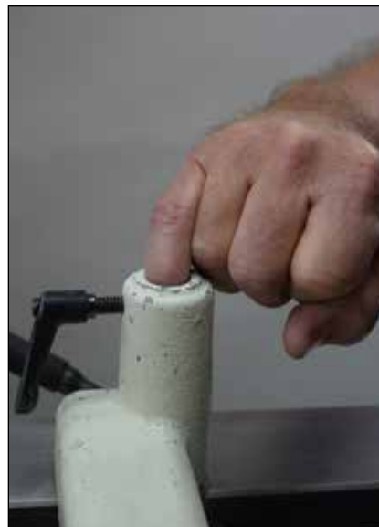
Picture #18 - 1410 Caption - Inspect the inside of the tool rest post hole. (This picture could easily be left out.)