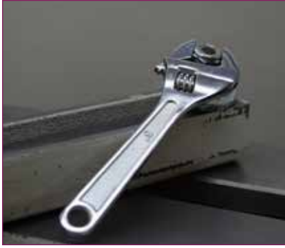
Locking nut 1387. You'll need a wrench to remove the banjo locking nut and pressure plate.