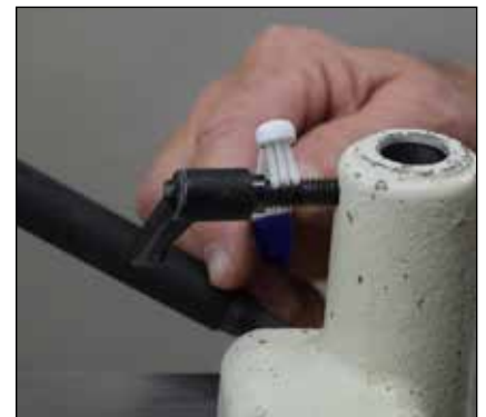
Picture #20 - 1414 Caption - Use a stiff brush to clean the threads of the tool rest clamp.