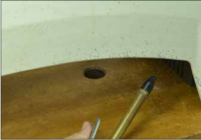
Picture #32 1454 Caption - Using an air hose with low pressure to clear dust from the motor and controls.