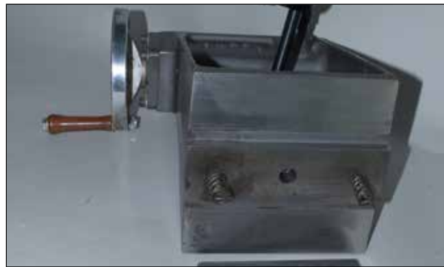
Picture #25 - 1433 Caption - Some lathes will have rectangular locking plates and springs.