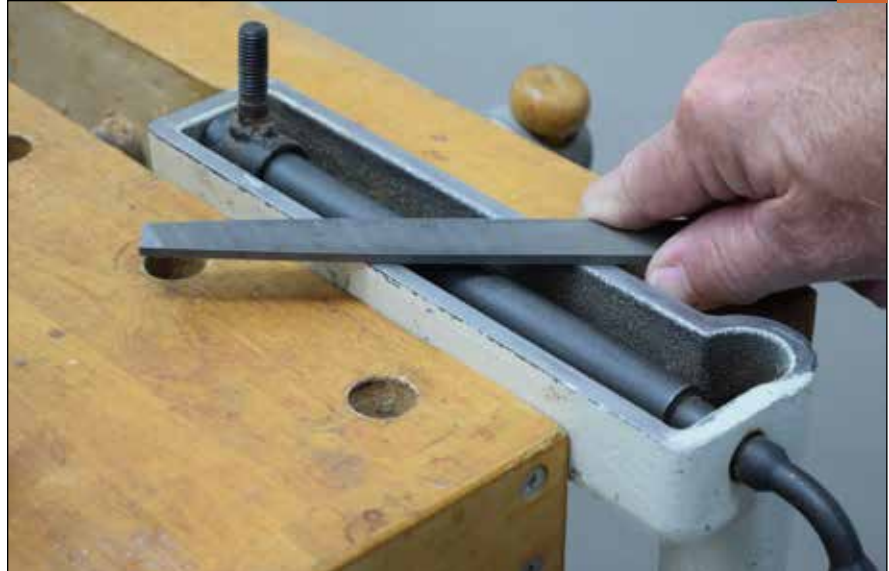
File the banjo 1390. Place a file flat across the bottom of the banjo and run it over the full length. Use a light touch. Do the edges too, inside and outside.

Clean the eccentric locking rod underneath the banjo so that it rotates freely. Remove any rust with emery cloth and wipe away any residue. Dry-lube the rod to avoid dust buildup. Also clean and lube the ends of the locking rod.