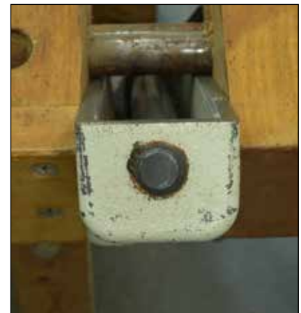
Rod ends 1406. Clean both ends of the banjo locking rod. Lubricate with a dry lubricant.