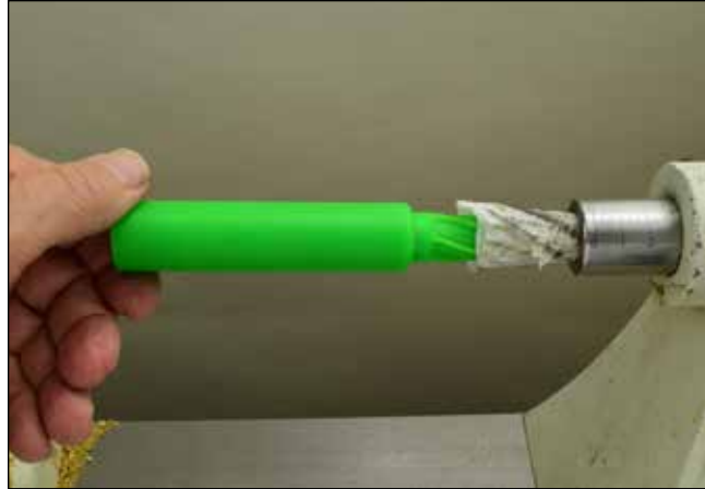
Quill 1039. A dirty or damaged quill compromises all operations of the tailstock. Clean it with mineral spirits and a twisted paper towel.

Like the banjo, the tailstock mechanism has a sweet spot. If the tailstock slips, or is difficult to move, you'll need to adjust the locking nut to find it.