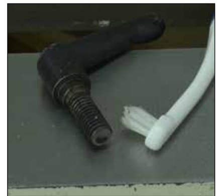
Locking lever 1445. Use a small stiff brush to clean and lubricate the locking lever on the tailstock.

Return the tailstock to the ways for easy access to the quill and hand wheel. Use a stiff brush to remove accumulated dust where the hand wheel shaft enters the tailstock and apply a dry lubricant. Clean the inside of the quill with mineral spirits and a twisted paper towel, a brush, or a Morse taper cleaner. Its condition is crucial to all tailstock operations. Insert a finger to feel for any ridges and remove them, though low spots are not a concern.