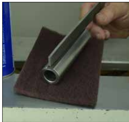
Quill channel 1449. Remove any dings from the quill channel with a file on edge, clean the outside of the quill, and dry-lube.