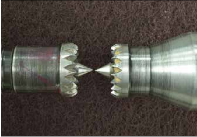
Alignment 1457. Check the alignment of the centers, looking down and looking in from level.