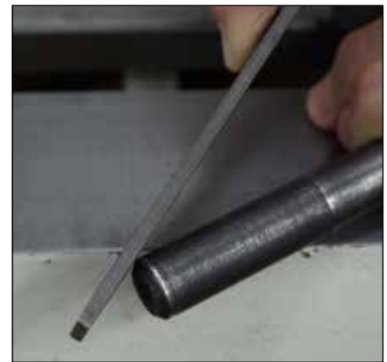
Chamfer 1421. Relieve the end of the toolrest post so it easily enters the post hole.

If the toolrest itself is soft steel, remove any dings with a bastard-cut mill file. Here, low spots are as much a concern as high spots -- any variations will be transferred to your turnings.