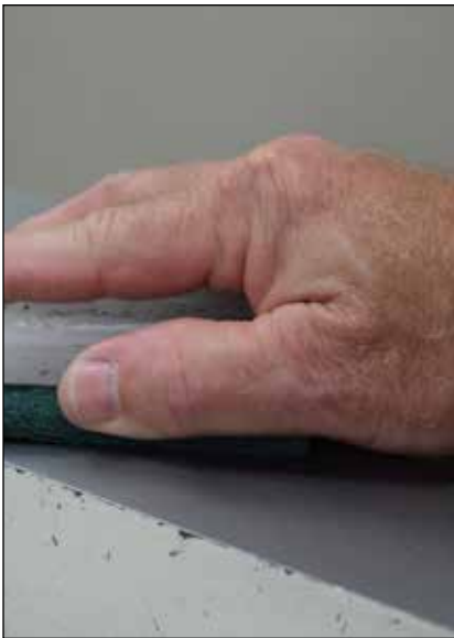
Picture # 10 - 1377 dupe Caption - Load a non-woven abrasive with wax and apply to the top and side surfaces of the ways, but not the bottom.

The August 2014 issue of the American Woodturner has an in-depth article on maintaining and renewing Morse tapers. This article is a must read.