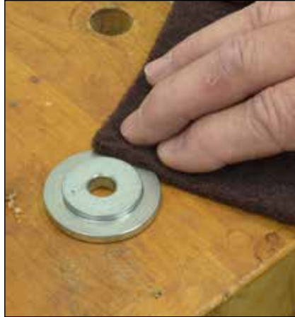
Locking plate 1405. Locking plates can be circular or rectangular. They should be cleaned, but not waxed or lubricated.

Clean any grime inside the post hole with rolled up non-woven abrasive and mineral spirits and wipe clean. If the toolrest does not move freely, use emery cloth. Finally, remove the toolrest clamp handle. Clean the threads and inside and out, and dry-lube.