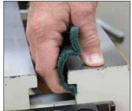
Picture #6 - 1374 dupe Caption - Cleaning the inside and underneath sides of the ways. Be sure to finish with a clean paper towel.