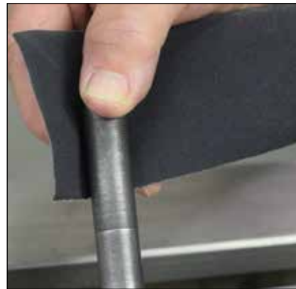
Toolrest post 1424. Remove dings on the toolrest post with emery cloth, or a file.

The toolrest should not encounter resistance as it enters the banjo. Inspect the end of the toolrest post, its edge should be chamfered. Dry lube aids smooth movement.