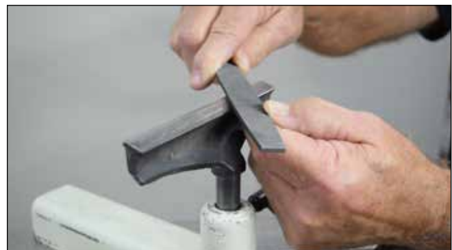
Toolrest 1428. Draw a file with both hands over the full length of the toolrest to remove any dings.

It is important that the toolrest is true across its entire length, so draw-file it end to end.