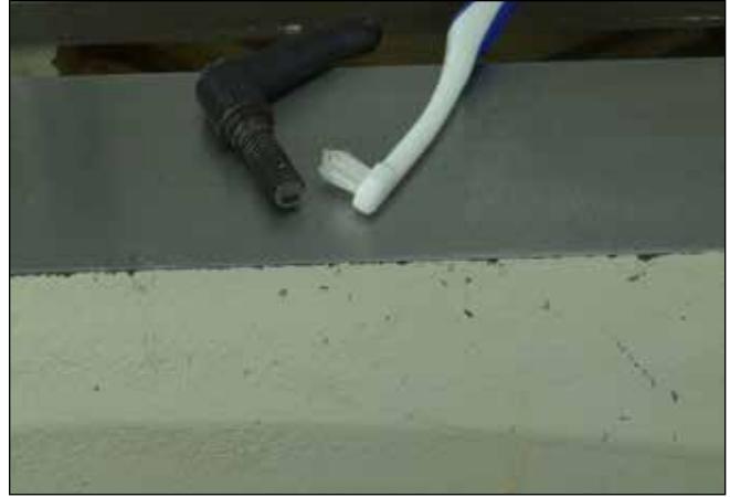
Picture #30 - 1445 - wrong pic this is #27 Cleaning the threads of the tail stock spindle lock.