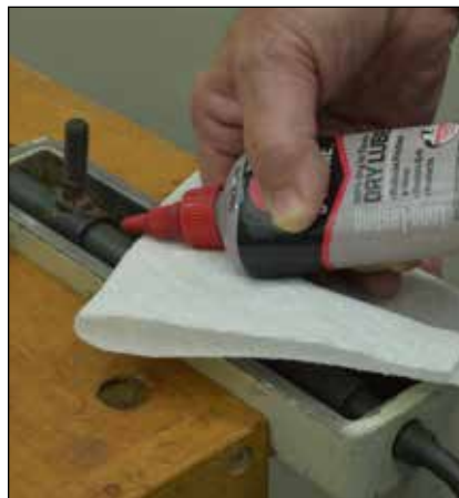
Dry lube 1402. Apply a dry lubricant that does not attract and hold dust to the locking rod.