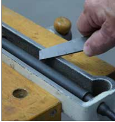
Picture #13 - 1392 Caption - Also smooth the inside edges of the banjo.