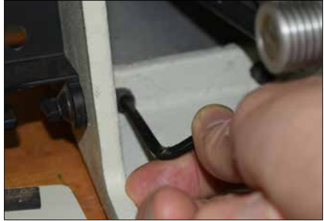
Realign 1271. Loosening then retightening the bolts holding a headstock to the ways may improve alignment.