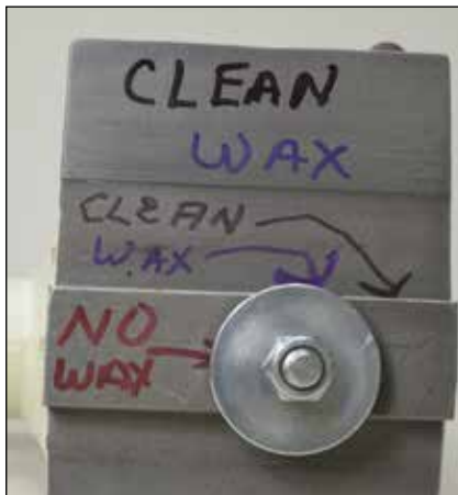
Picture #26 - 1473 Note to editor. Use # 1440 with typing in lieu of my printing. Caption - After cleaning, lubricate the tailstock surfaces that make contact with the ways.