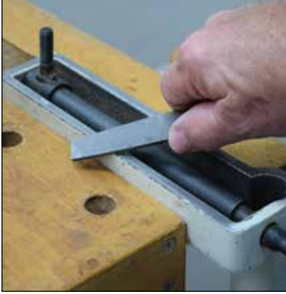
Picture #12 - 1391 Caption - Remove any dings from the outside edges of the banjo.