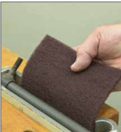
Eccentric rod 1399. Remove rust and grime from the locking rod with mineral spirits and non-woven abrasive. Do not wax.

Return the banjo to the ways to inspect and clean the toolrest post hole. Inserting a