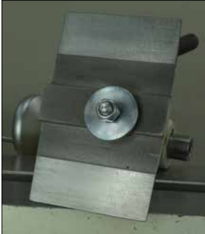
Tailstock-1439. Run a mill file over the flat bearing surfaces and each edge.