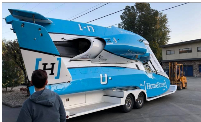
Miss Madison Racing

The HomeStreet/Miss Madison Racing team has brought both their hulls, “blue” #0706 and “white” #1801, to the Tukwila, Washington, shop after the season-ending San Diego race. Along with the HomeStreet Bank display hull, the team is working on off-season maintenance and going through their complete inventory of equipment in Washington. The shop in Madison, Indiana, is not large enough to accommodate all of the team’s current assets. There has been discussion and plans of a future race shop in Madison to work from, but until that shop materializes, the team will work out of the HSR shop in the Northwest.