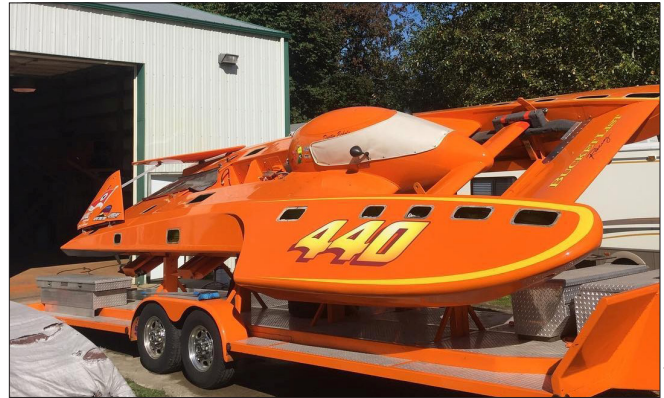
Bucket List Racing

The Bucket List crew has stripped down and de-salted the hull and hardware, began fabricating new parts, and is building a new cowling. They recently took their T-53 engines and parts to Whispering Turbines in Montana for a complete de-salting, inspection, and dyno work.