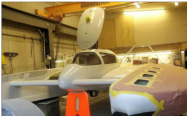
Go Fast Turn Left Racing

The GFTL team is getting the current U-21 hull winterized and prepped for the 2019 season (bottom). Work is continuing on finishing the new U-48 GFTL hull (below). The current plan is to have both hulls ready for the annual Tri-Cities spring testing. Based on testing, a decision would then be made as to which hull will be their primary hull going into 2019.