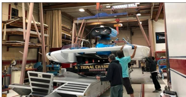
Miss Madison Racing