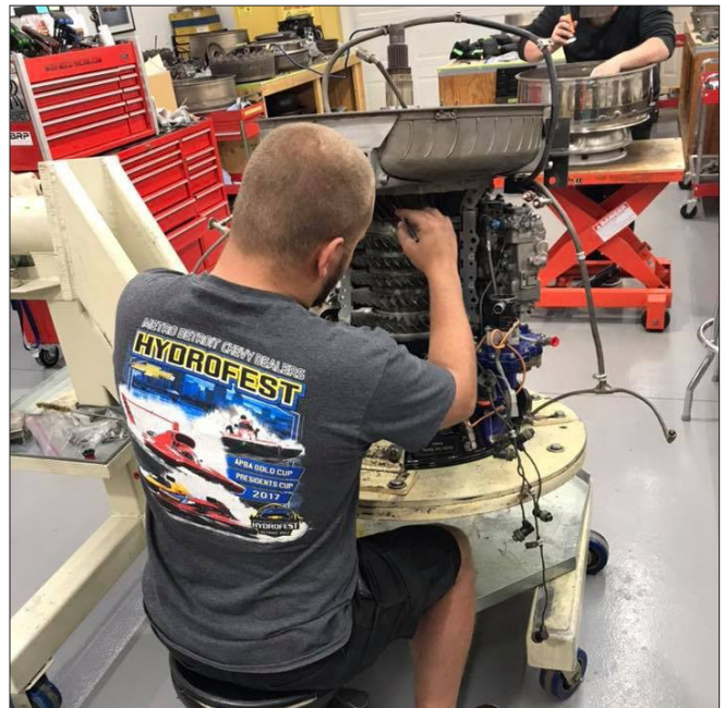
Bucket List Racing