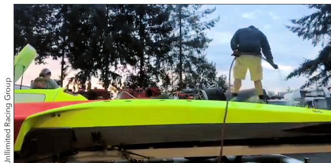
Unlimited Racing Group

A recent crew night at the Reliable Diamond Tools presents J&D's shop in Edmonds, Washington, had the team trailer firing (below) and testing electrical systems. The electrical system required replacement after suffering a salt water bath in the final heat at San Diego Bayfair. The new system and spares all checked out and performed perfectly.