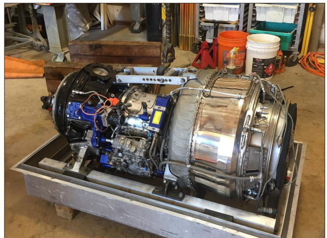
Bucket List Racing