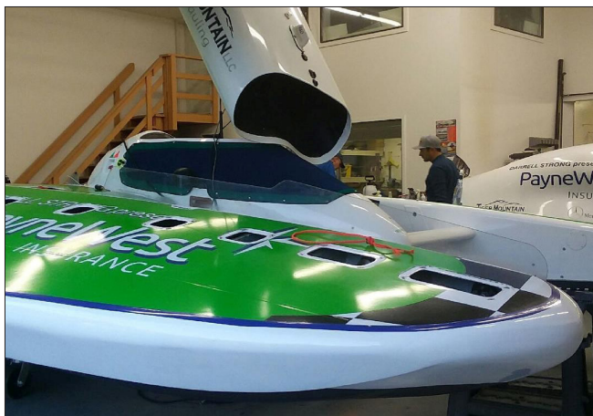
Go Fast Turn Left Racing