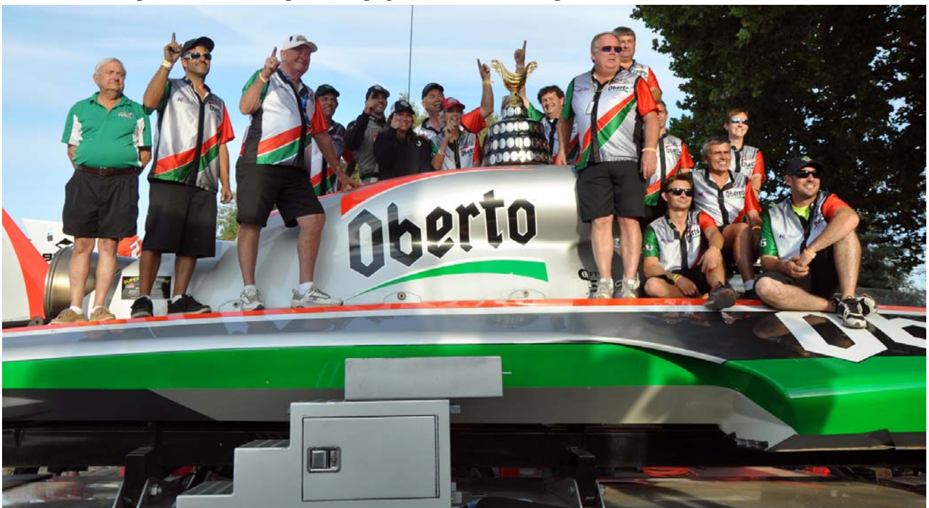
Below and top of next page the very happy Oberto/Miss Madison Team standing on the winning boat with the APBA Gold Cup.