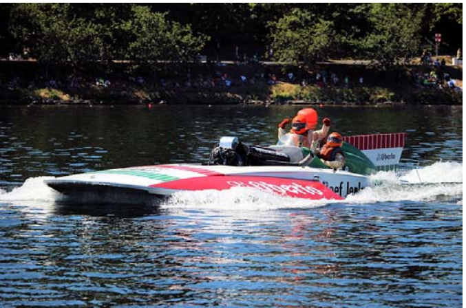
Karl Pearson photos