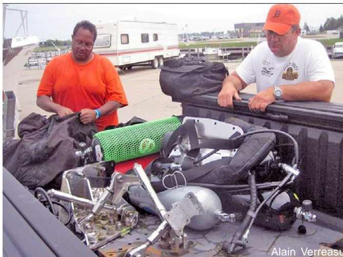
Alain Verreasult facebook page