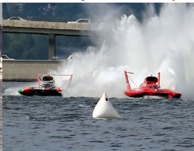
Above left, Oberto and Graham Trucking in the air battling for the lead. Above right Graham Trucking is coming out of the turn minus the rear wing. At right Oberto bumps into Graham Trucking heading for the finish line.