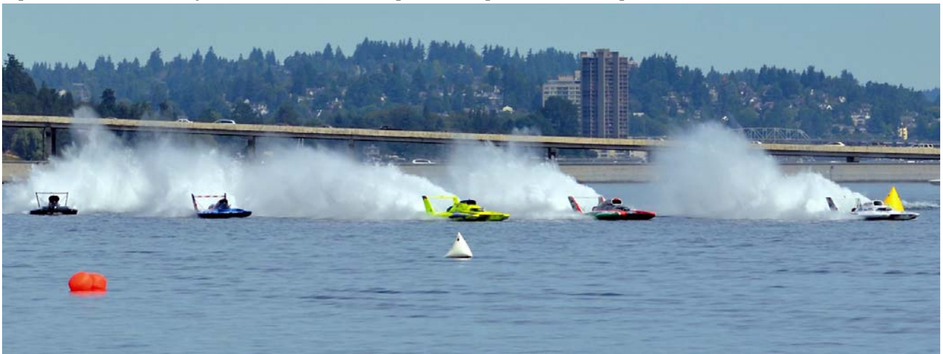
Above, ELAM Plus on the inside lane with the Oberto , Peters & May , Carstar , and Graham Trucking II running outside all heading for the starting line for 2A.

Back to two sections of six boats each for heats two and three. During the score up, Jean Theoret in ELAM Plus destroyed a buoy and also violated the DMZ, thereby receiving a one lap penalty. ELAM Plus in lane 1 and Oberto in lane 2 lead the way into the first turn. The U-1 led at end of lap 1. Unable to maintain control in lane 1, Theoret hit two more buoys during the heat. Oberto , with superior boat speed, stretched it out to win the heat easily. The U-7 Graham Trucking II finished second, followed by the U-21, U-11, U-100, and U-96, who won a one lap penalty for dislodging buoys. Not cornering as well as Graham Trucking II or Oberto , ELAM Plus had now been beaten twice by being squeezed in lane 1 by boats in lane 2, in spite of superior chute speed.