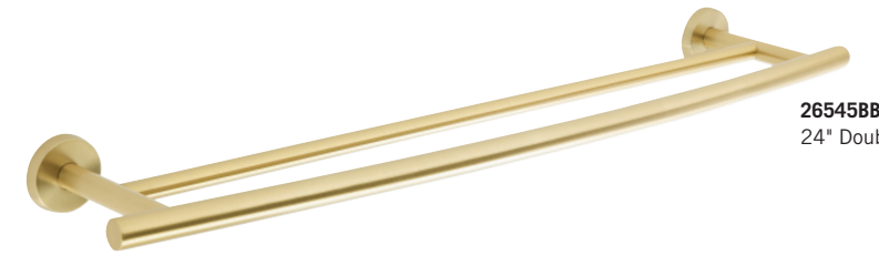
26545BBZ 24" Double Towel Bar

Pack type information can be located in the Product Index that begins on page 213.