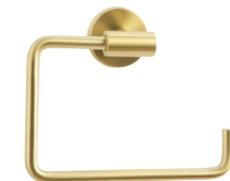
26541BBZ Towel Ring