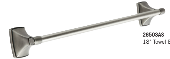
26503AS 18" Towel Bar