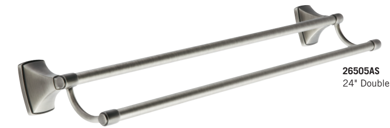
26505AS 24" Double Towel Bar

Pack type information can be located in the Product Index that begins on page 213.