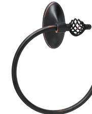
26521ORB Towel Ring