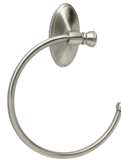
26531G10 Towel Ring