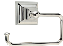
26510PN Tissue Roll Holder