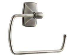
26501AS Towel Ring