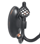
26522ORB Robe Hook