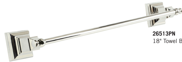
26513PN 18" Towel Bar