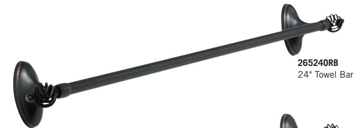
26524ORB 24" Towel Bar

Pack type information can be located in the Product Index that begins on page 213.