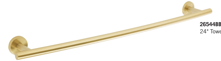
26544BBZ 24" Towel Bar