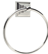
26511PN Towel Ring