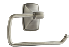
26500AS Tissue Roll Holder