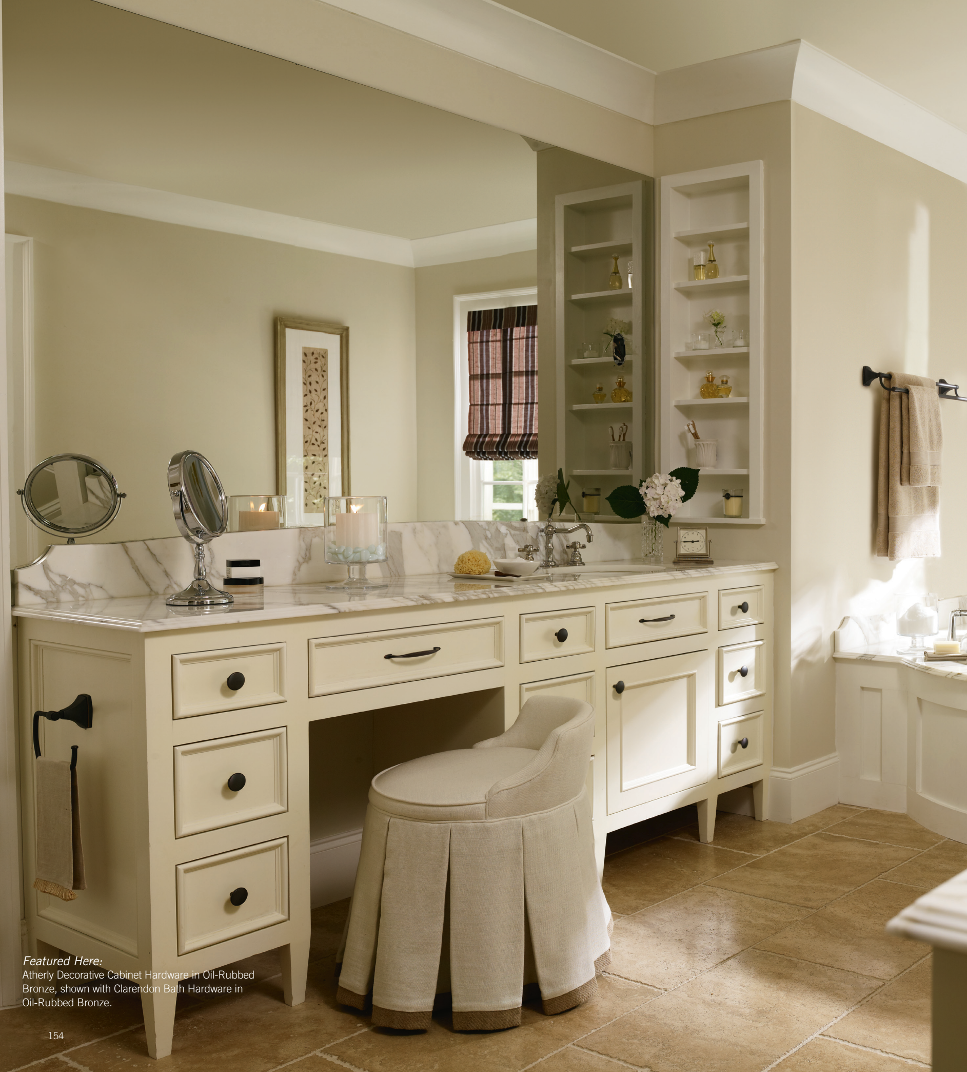
Featured Here: Atherly Decorative Cabinet Hardware in Oil-Rubbed Bronze, shown with Clarendon Bath Hardware in Oil-Rubbed Bronze.