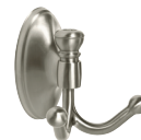
26532G10 Robe Hook