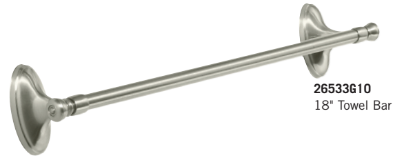
26533G10 18" Towel Bar