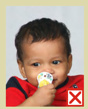
Dummy in mouth