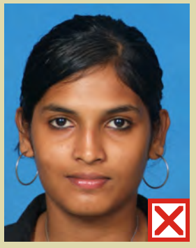
Incorrect background colour