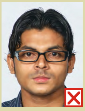
Frames too thick / heavy