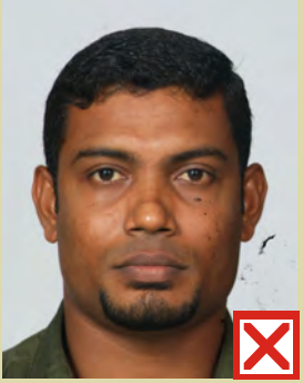
Ink mark / creased