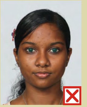
Contact lens obscuring eyes