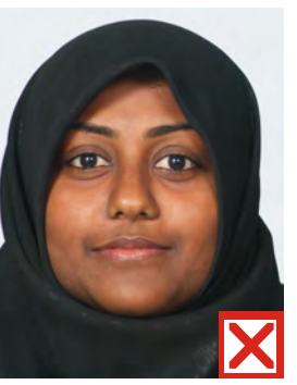
Shadows across face / forehead partially covered