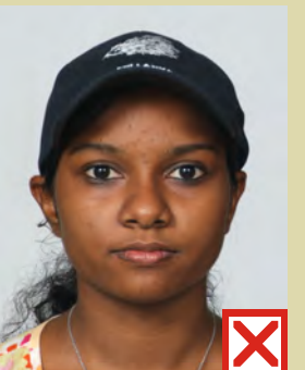
Wearing hat, thaakiha or fagudi