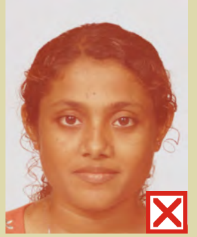
Washed out color