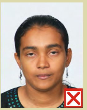
Eyes partially closed