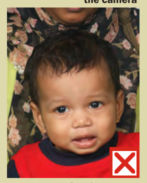
Another person in background