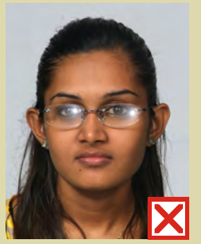
Flash / light reflection on lens