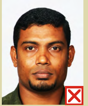
Contrast too high