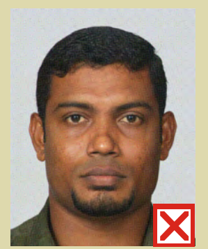
Visible dot pattern