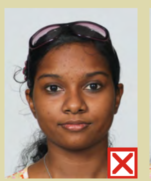
Sunglasses either on face or on head

are not permitted except for religious or medical reasons, but your facial features from bottom of chin to top of forehead and both edges of your face must be clearly shown with no hair across the eyes or covering the edge of face