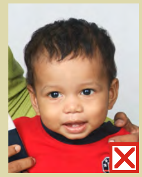
Another person's hand visible