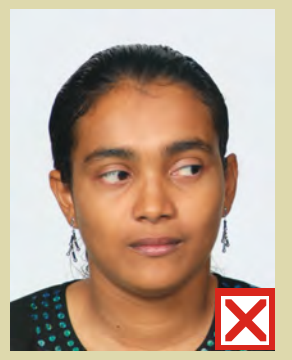
Eyes looking away