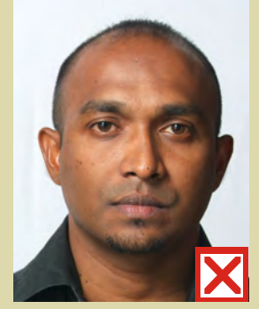
Shadows on face