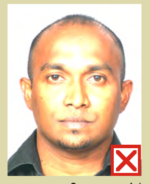
Over exposed / flash reflection