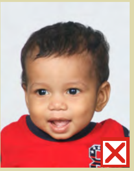
Looking away from the camera