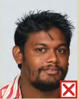
Head not facing camera