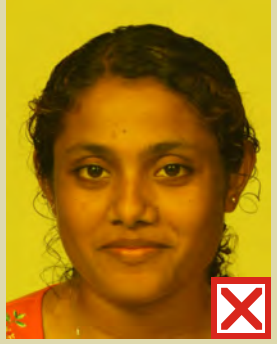
Unnatural skin tones