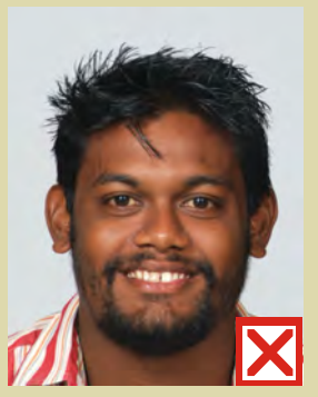
Expression not neutral