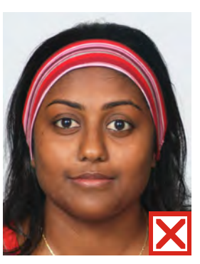
Headband or bandana partially covering forehead