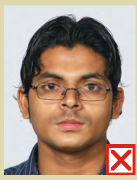
Frames obscuring eyes