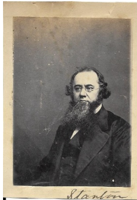
Edwin Stanton (1814-1869)

He is a friend of Black and has helped research parts of the President's December 3 message to Congress. But more importantly, Stanton, a Democrat at the time, is also linked directly to Senator Henry Seward, who will serve in Lincoln's cabinet. This gives the Republican's a direct line into the workings of Buchanan's inner circle all the way up to the inauguration.