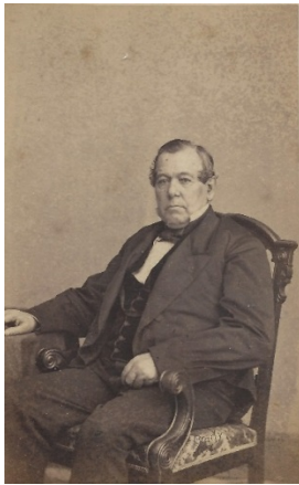
Thomas Corwin (1794-1865)

The House leads the way here on December 11 by forming its “Committee of 33” comprising one member from each of the thirty-three states – with 18 Free and 15 Slave.