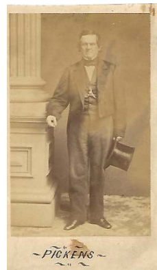
Francis Pickens (1807-1869)

All hope of relief in the Union...is extinguished...the Republicans are resolute in the purpose to grant nothing that will or ought to satisfy the South.