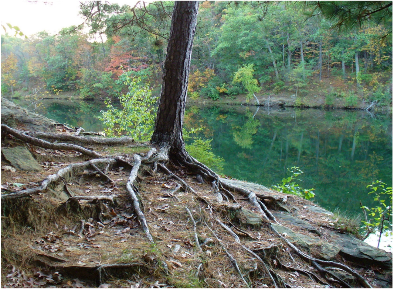
Red Pine near Madison, Wisconsin.

7 Blessed are those who trust in the LORD, whose trust is the LORD.