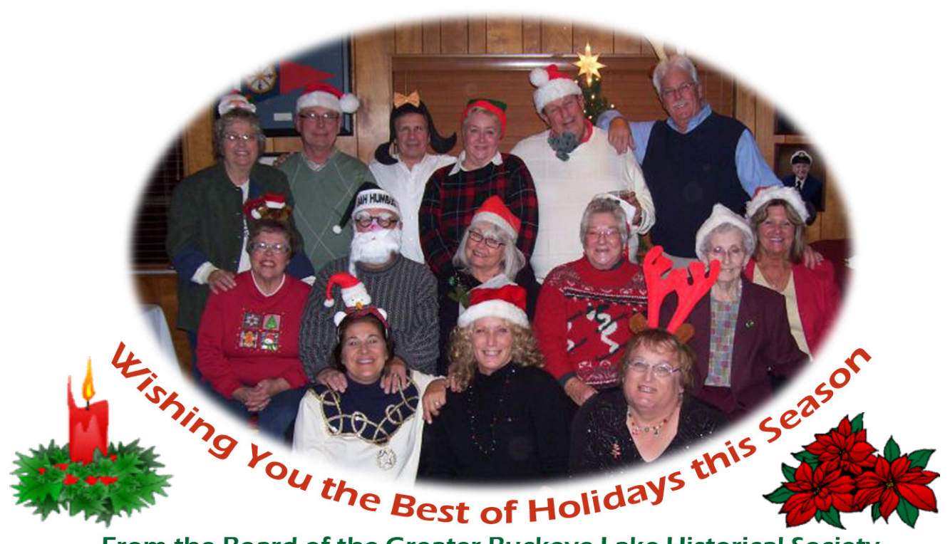
From the Board of the Greater Buckeye Lake Historical Society