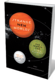
Strange New Worlds: The Search for Alien Planets and Life Beyond Our Solar System

The title of Jayawardhana's book reflects the