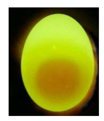
Yolk and membrane visible inside the egg

Note: If an egg is fertilized that does not mean there is a baby chicken inside the egg. A freshly laid fertilized egg can be eaten and it will taste the same as an unfertilized egg.