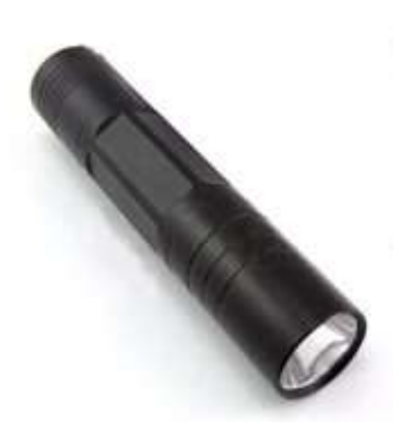
Egg candling torch or light