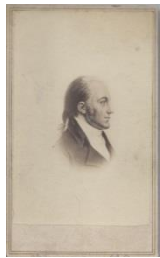
Aaron Burr (1756-1836)

Aaron Burr is one of those famous figures in American history who climb to the pinnacle of national fame only to fall back into the ranks of the notorious.