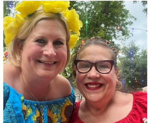
Members, our Royalty, and our Ingenues were very engaged in Fiesta events. They participated in the Fiesta Beethoven Gartenfest, the King William Parade, the Battle of Flowers Parade and everything in between.