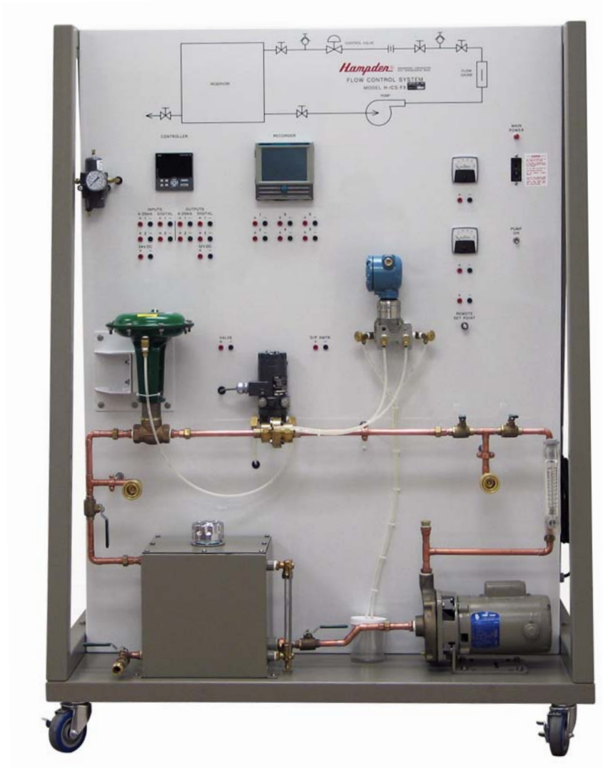
Hampden MODEL H-ICS-FX Flow Control Panel Dimensions: 72"H x 48"W x 34"D Shipping Weight: 928 lbs.

Water flow rate is measured by a differential pressure transmitter, which outputs a 4-20 mA signal proportional to differential pressure across an orifice plate. This signal is received by both a chart recorder and a microprocessor-based controller.