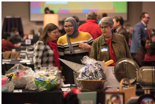
Attendees and scholarship recipients eye the assortment of baskets donated for the silent action at the 2020 ELL Foundation Recognition Breakfast