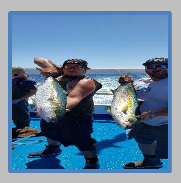
The boat Freedom out of 22 St Landing on 7/26 By Dave A Smith

Went on the boat Freedom out of 22 St Landing on 7/26. Got one 26 LBS Yellowtail. Fun trip, good cook on boat. The crew was very helpful! Dave Smith, Long Beach. (KC Angler)