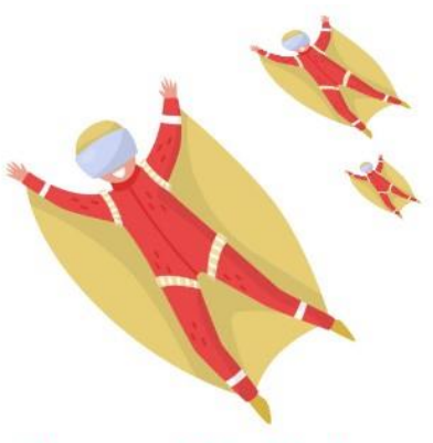
(Nope, not this kind!)