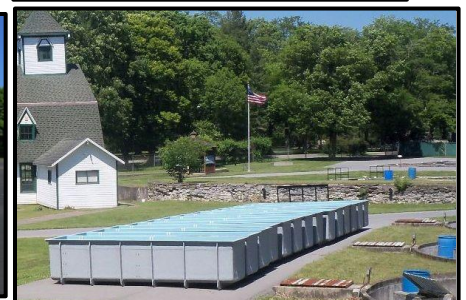
Bottom right: fiberglass raceways staged for installation in fish culture building