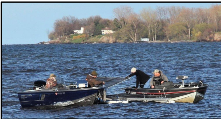
Releasing pen-raised steelhead trout into Lake Ontario

On May 7 th four volunteers with two 17-ft. aluminum boats transported two pens each containing 5,000 pen-raised steelhead from Oak Orchard Creek into Lake Ontario at Pt. Breeze for release. The task began at 7 p.m. and took two hours to complete. By releasing the fish directly into Lake Ontario in the late evening, there would be less predation from the large population of migrating double crested cormorants. The fish could acclimate to their new environment, disperse into the lake under cover of darkness and hopefully have a better chance of survival. Some predation from terns and gulls was observed but none from cormorants. The salmon stocked for Oak Orchard were also pen raised but were released in the creek and had to make their way to Lake Ontario by their own instincts.