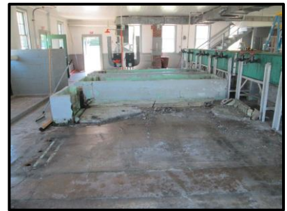
Top: interior of fish culture building with concrete raceways being re-moved

Some of the new fiberglass raceways have been waiting for about three years on the asphalt at the hatchery to be installed and are now in place. These pictures illustrate good news. Perhaps by this fall the Caledonia Hatchery will be back to full production. Over the last three years we have had to mark the sidewalk to see if any movement had occurred. They are now proceeding at a gallop by comparison!