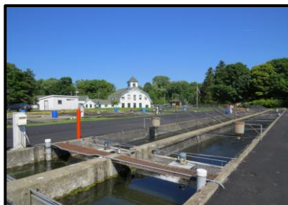
Bottom left: outside raceways with fish culture building in background