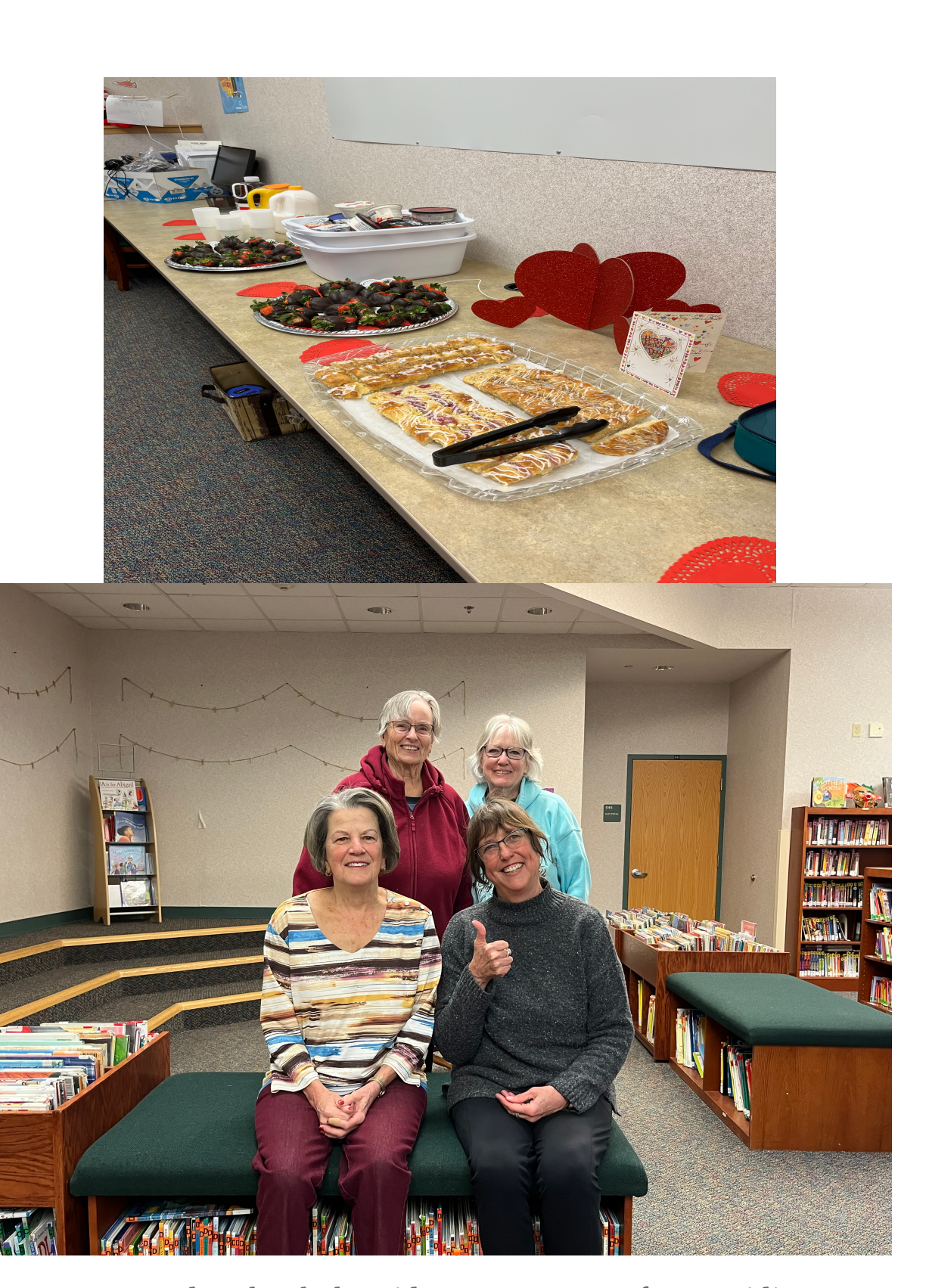
We wanted to thank the Kids Hope mentors for providing a