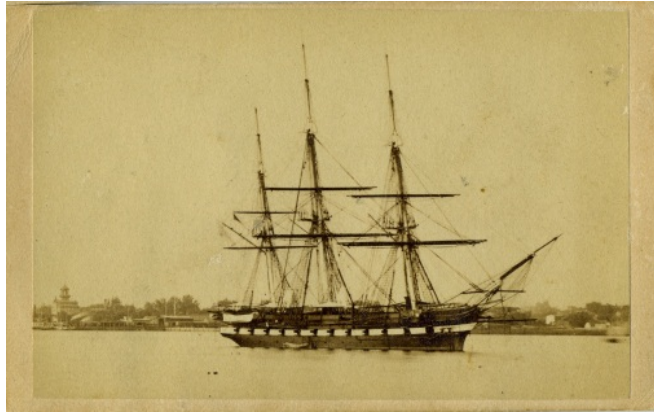
U.S.S. Constitution, Commissioned in 1797.

As 1798 closes, Adams' efforts to hold out for peace are being off-set by Hamilton and even Washington, both apparently eager to fight the French. Secretary of War McHenry conspires in the effort, sharing secret documents with Hamilton while cautioning him to act surreptitiously.