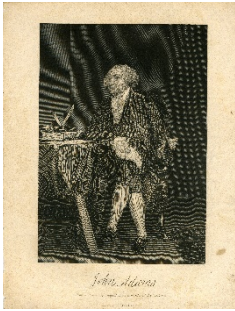
John Adams (1755-1835)

With Washington retiring, the United States experiences its first genuine “race” for the presidency, in 1796.