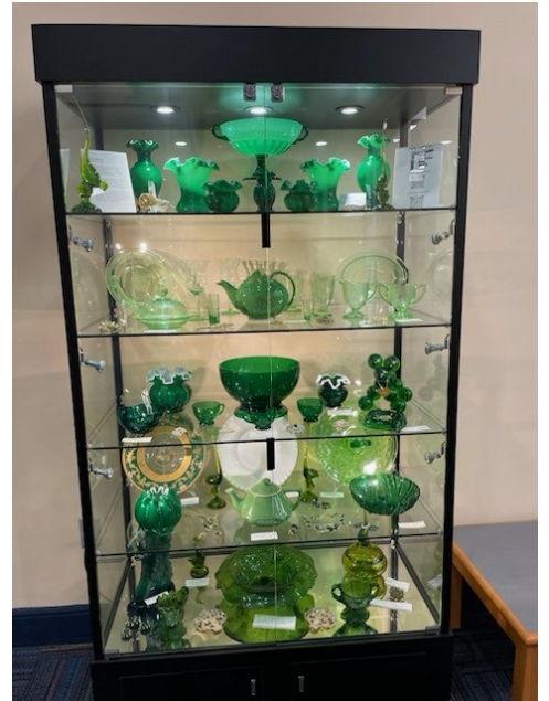
The club's display at the East Bank Regional Library. This month's display celebrates May's birthstone: emerald.

Programs that year included Block Optic, Iris & Herringbone, Old Colony (Lace Edge), Swirl, and Tea Room. Show & Tell featured butter dishes, candlesticks, and kitchen items.