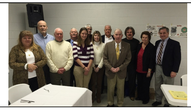
New officer/board members and committee chairpersons for 2015