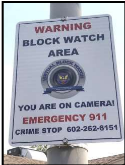
New Virtual Block Watch Signs look great!!