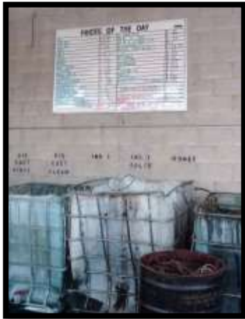
Recycling our old signs 104 pounds!!