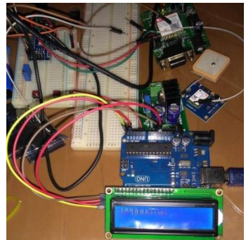
Figure 1: Pothole Detection

location along with google maps link should be sent through GSM module to the database. Third, representation module which analyzes the data received from WiFi node and warns the driver regarding the occurrence of potholes by displaying POTHOLE AHEAD on the LCD monitor as shown in fig 1.