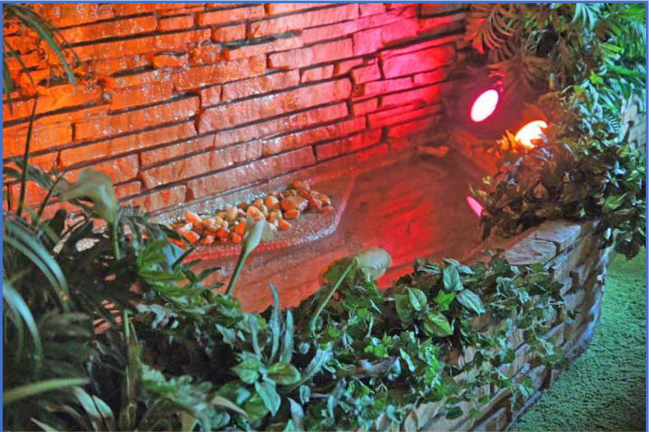
A close-up of the fireplace.