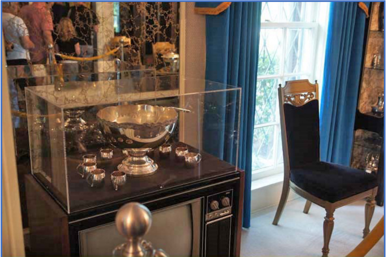
A silver punchbowl set.