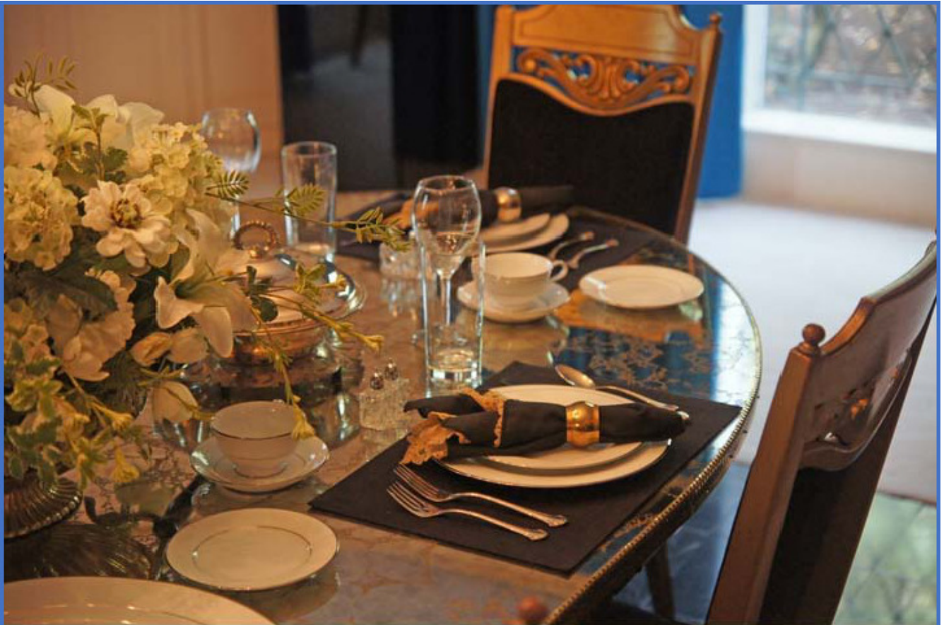
A closer view of a place setting.