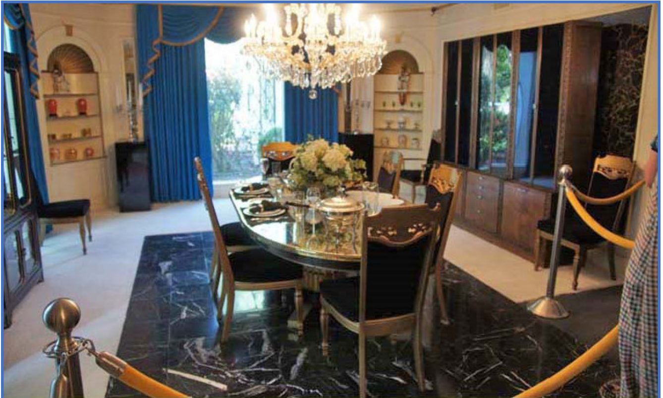
The dining room.