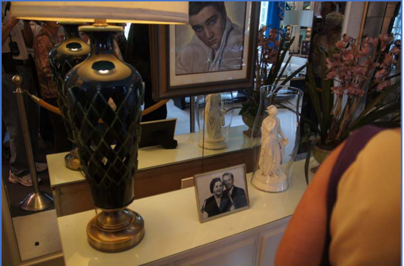
Inside Elvis Presley's Mansion.