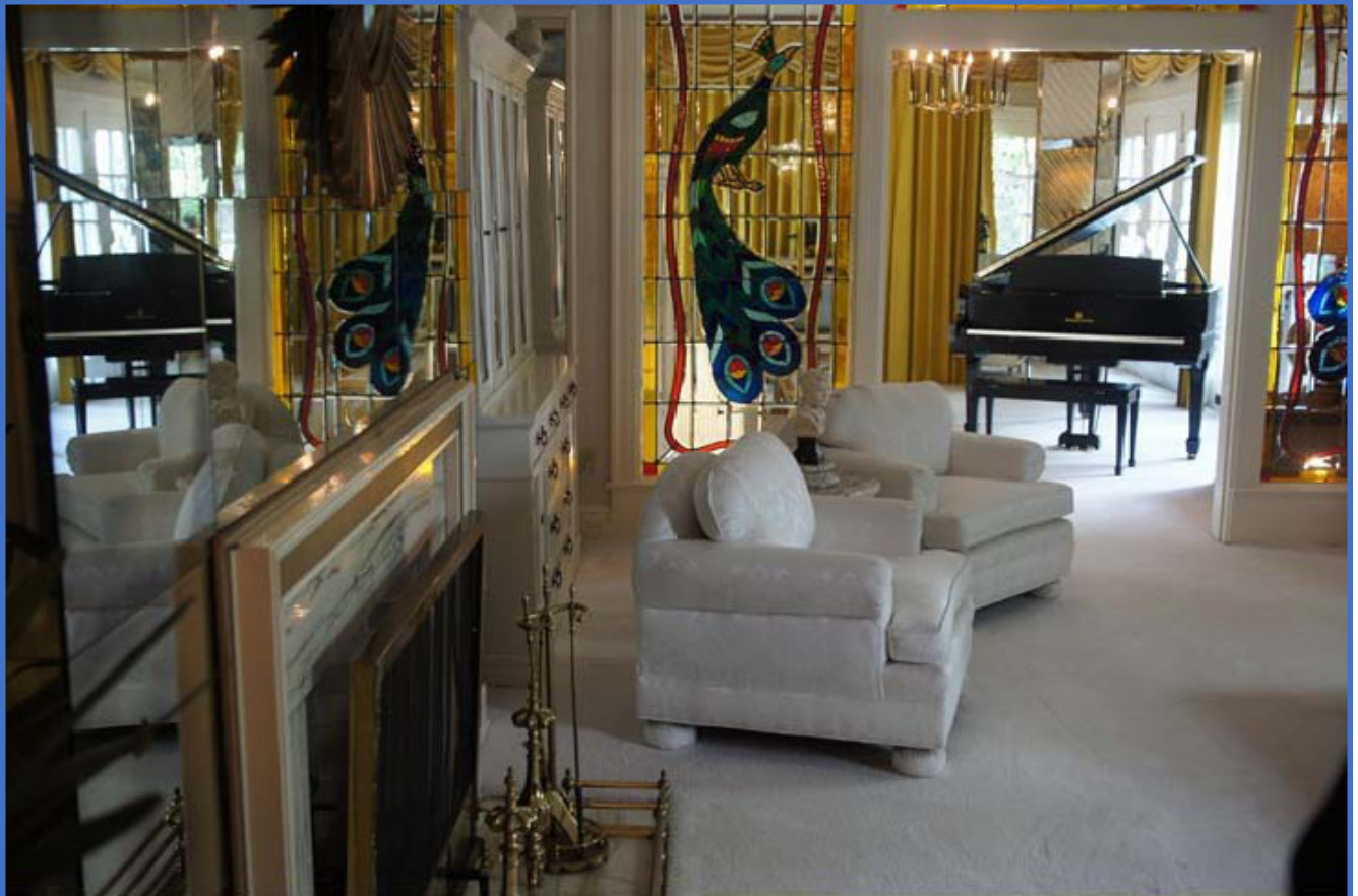
The living room with the music room behind it?