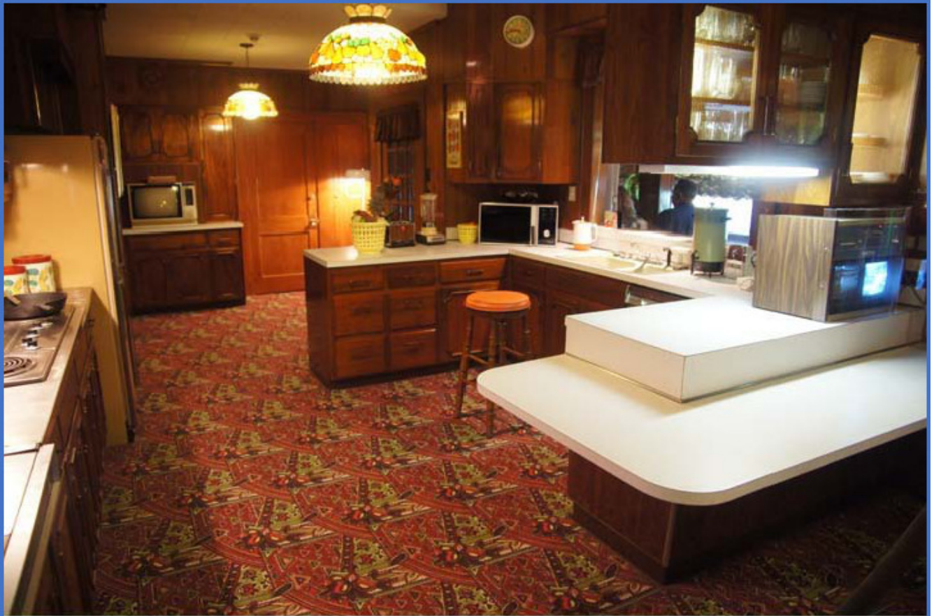
The very “modest” kitchen.