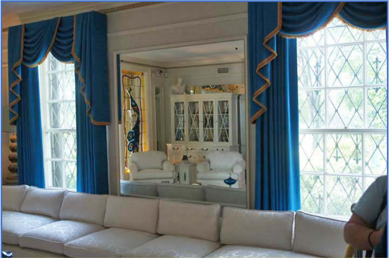
Another view of the living room.