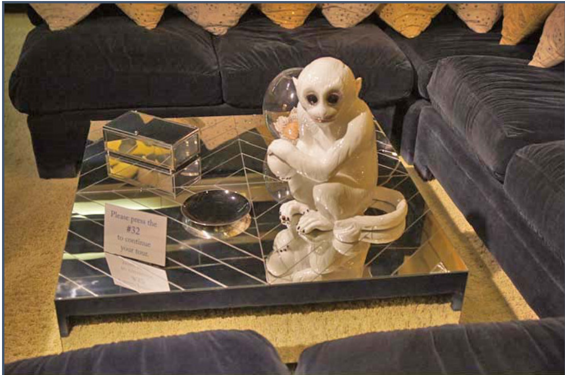
A close-up of the monkey.