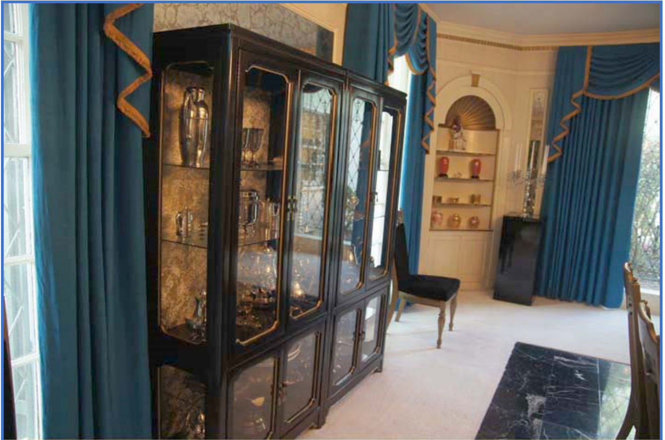
A chinaware cabinet.