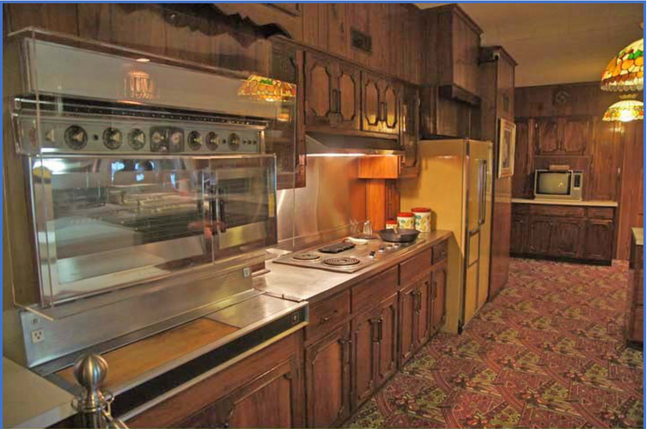
Another view of the kitchen.