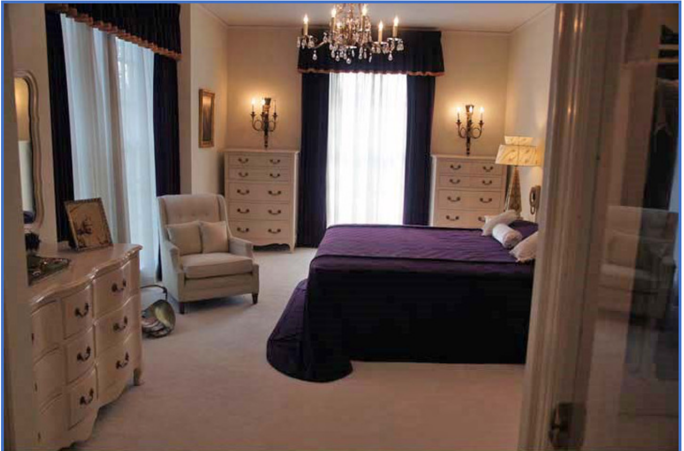
The master bedroom?